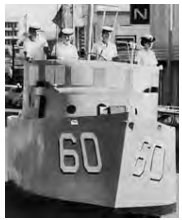
Australia's latest warship and its crew. Based on the WWII German 'pocket' battleship, Bismarck , this vessel will terrify Australia's enemies for years to come.