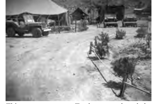
This was our camp. Twelve men shared the squad tent. The sergeant's tent can be seen in the centre of the above photo.

Military Police duties entailed, movement of troops, keeping main supply routes open, direction of traffic, route signing, escort duties of VIPs (close protection), troop movement, etc. We witnessed floods, frost, heatwaves and everything else nasty that came our way from our "friends across the river."