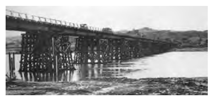
By August 1952 there were five bridges spanning the Imjin on the Wyoming Line .

We slept in tents, dug-outs, on our feet, just about any where. We did have sleeping bags, mine was white on issue, but after the first few months, was caked in mud and stale sweat, and was black. But it was heaven to climb into, when in winter your breath froze on your whiskers, and the space heater was on the blink.