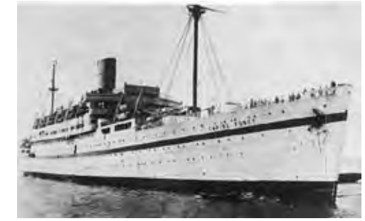
HMTS Empire Fowey (ex-Potsdam)

We didn't have many prisoners to attend to, and exercising them was a bonus as we could do that in places that the other "Squaddies" didn't have access to. We only had one difficult prisoner, who was determined to "work his ticket" His antics are not for the pages of this newsletter as they come under the PGR classification. He was taken off in Singapore, having achieved his aim.