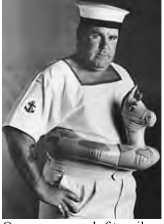
Our young and fit sailors have access to the most modern and effective life-saving devices.