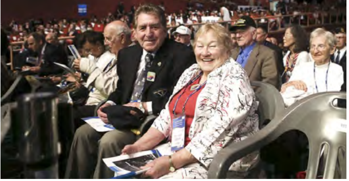
At the 62nd Korean War Armistice Commemoration Ceremony on the 27th.

*crump (noun): the thudding sound of an exploding bomb or shell. Very familiar to those in Korea in 1950-1953.