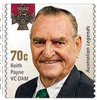
THE VOICE Page 11

I was down at my local sub-newsagent a few weeks ago in search of postage stamps. I bought a book of ten then on examining it realised I was holding multiple images of Keith Payne VC OAM, Korea and Vietnam War veteran and KVAA Inc. member. Fortunately the stamp is the 'peel and stick' type rather than the traditional 'lick and stick', thus sparing me having to lick the back of Keith's head. The stamp is part of the 2015 Australian Legends issue that honours recipients of the Victoria Cross. It was released on 22 January 2015 and will be withdrawn on 31 December, so get a booklet of 'Keiths' while you can. (I was going to suggest you get a booklet of 'Payne' but changed my mind for obvious reasons.)