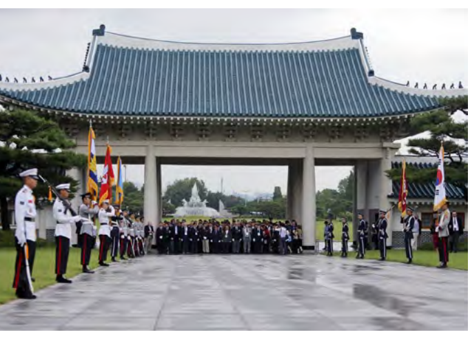
Wreath Laying and Incense Offering Ceremony on the morning of the 25th.