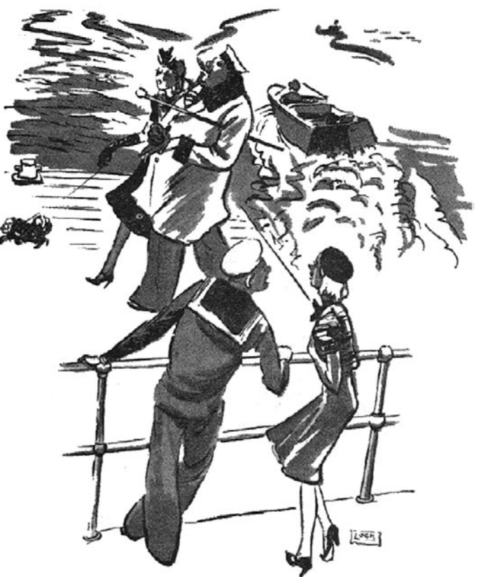
"Admiral, me foot - he's the ship's S.P. Bookie!" THE VOICE Page 7

WWII was the first war in which the bombing of civilians was adopted as a deliberate policy Overall the Germans dropped 74,000 tons of bombs on Great Britain, killing 51,000 people. The Allies dropped nearly 2 million tons of bombs, killing 600,000 German civilians, 62,000 Italians, and more than 900,000 Japanese.