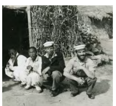
Unknown Korean village