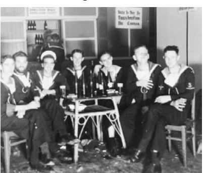
Warramunga Crew. Xmas 1952.