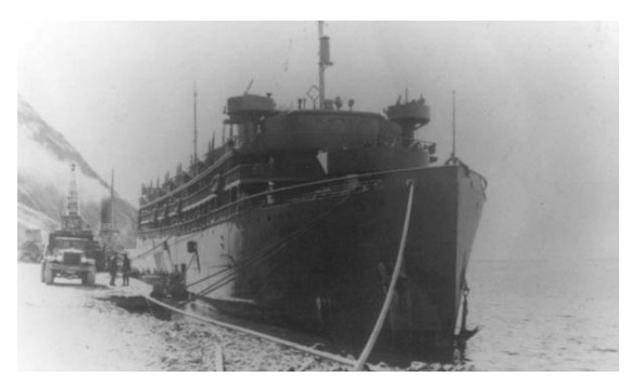
The Dorchester in its role as a USAT vessel

The Great Depression diminished the demand for luxury travel and the Dorchester was eventually mothballed. This changed in February 1942 when it was converted to a troopship with the addition of lifeboats and life rafts, as well as four 20mm guns, a 3 inch 50 calibre gun fore, and a 4 inch 50 calibre gun aft. Her large windows in the pilot house were reduced to just slits and the hull painted grey. The ship that once carried 314 passengers and 90 crew as the SS Dorchester now managed over 900 crew and passengers and sailed as the United States Army Transport ( USAT ) Dorchester .