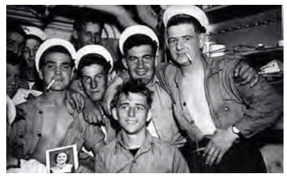
HMAS Anson crew, circa 1948-49.

Articles in The Voice are printed on the understanding that, unless stated, they are the original works of the contributors or authors. The editor reserves the right to reject, edit, abbreviate, rewrite or re-arrange, any item submitted for publication. The view of contributing authors are not necessarily those of the Association, the editor or publishers of The Voice .